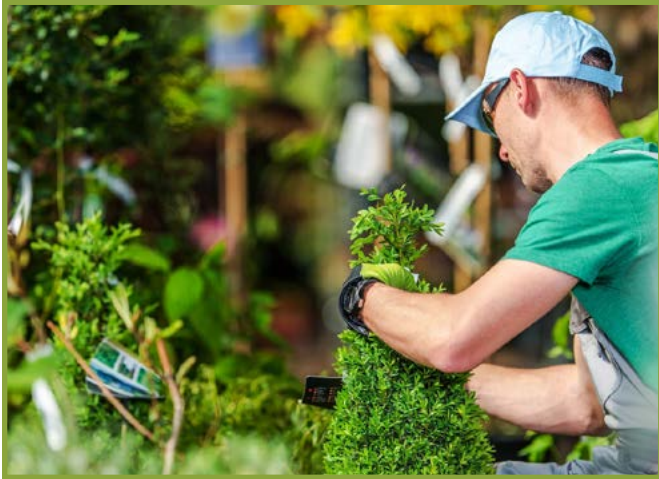
At Environmental Enhancements, employees will notice issues and suggest solutions to improve your property.